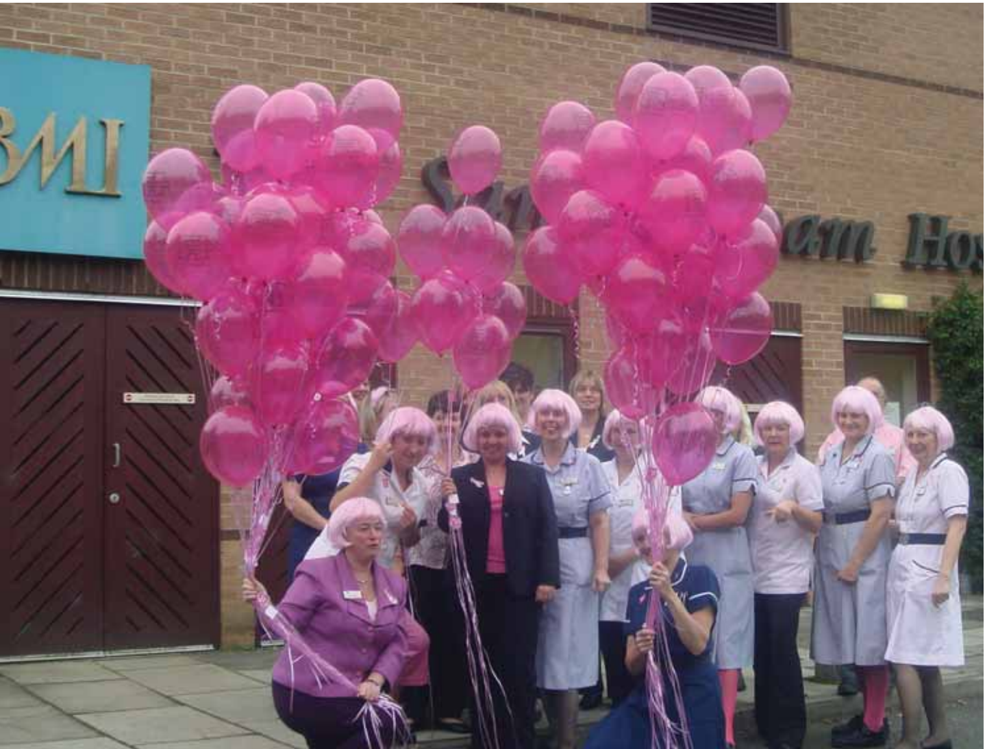
Nursing staff at The BMI Sandringham Hospital

All BMI hospitals support Breast Cancer Awareness Month in October, with events staged up and down the country, including Wear It Pink day in support of breast cancer research. Breast cancer is the most common form of cancer in the UK with one in nine women affected by it during their lifetime.