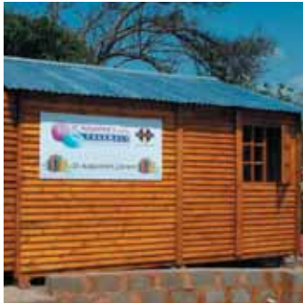
In September 2006, St Augustine Hospital and The Pharmacy Group spearheaded the launch of Clareville Primary School's first library.