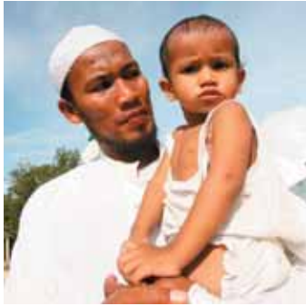
Netcare 911 together with Pick 'n Pay, Barloworld and Nedbank established the SA Tsunami Relief Fund for the construction of "South Africa" village in Banda Aceh, Indonesia.