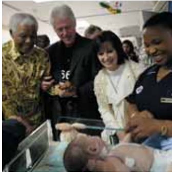
The Walter Sisulu Paediatric Cardiac Centre for Africa undertakes life saving cardiac surgery on indigent infants.