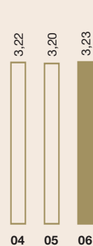
SA length of stay (days)