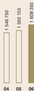
SA patient days (days)